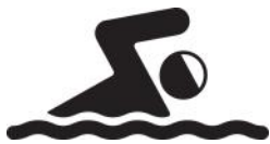
Join the Swim Team.