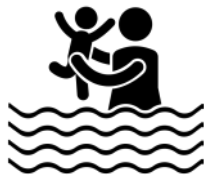
Learn a lifetime skill.